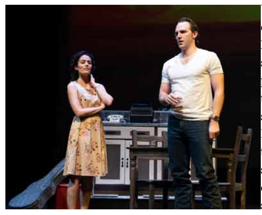
"The Bridges of Madison County"

the course of the next day, Robert and Francesca become aware of growing feelings for each other, leading to a romantic night together. When Robert invites Francesca to come away with him, will she forsake her seemingly oblivious family for the chance to recapture her dreams?