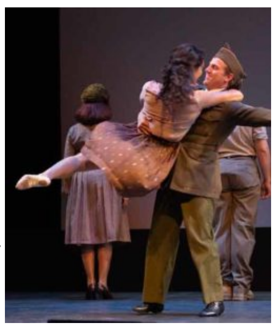
"The Bridges of Madison County"