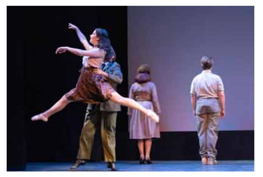
"The Bridges of Madison County"